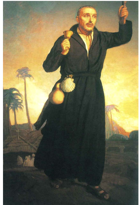
Francis Xavier with a crucifix and a bell, Shrine of Xavier, Navarra, by Elías Salaberría.