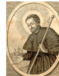
Francisco Javier (1506-1552)