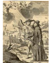
Pierre Favre (1506-1546)