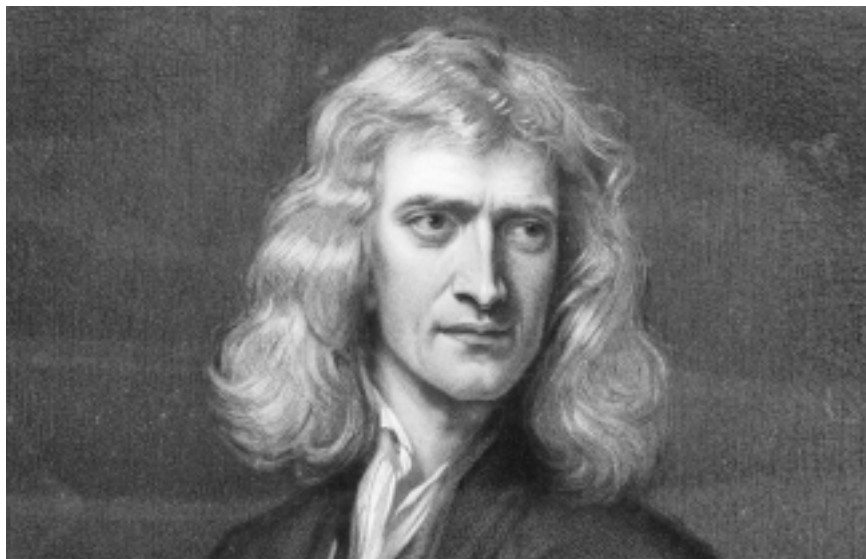
Sir Isaac Newton

However, the work of Newton was not limited to the field of scientific knowledge. It went along with a spiritual search that aimed