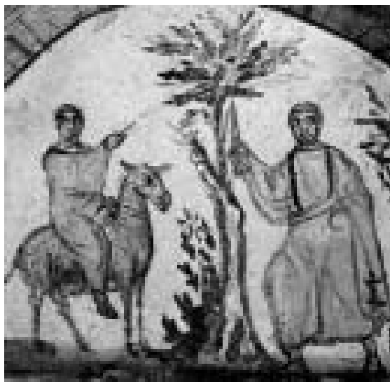
Balaam Meets the Angel on the Road

In the Second Week of a formal retreat, people are working chiefly with the Mysteries of the Life of Jesus. By imagining the ideal case, the exercitant comes to choose their own form of discipleship, or