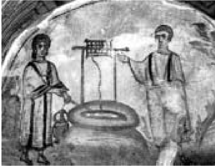
Jesus and the Samaritan Woman

new ways. Particular experiences then surface, in ways that can be consciously stimulated and to some extent steered—but what directs the process is what is actually going on within the retreatant.